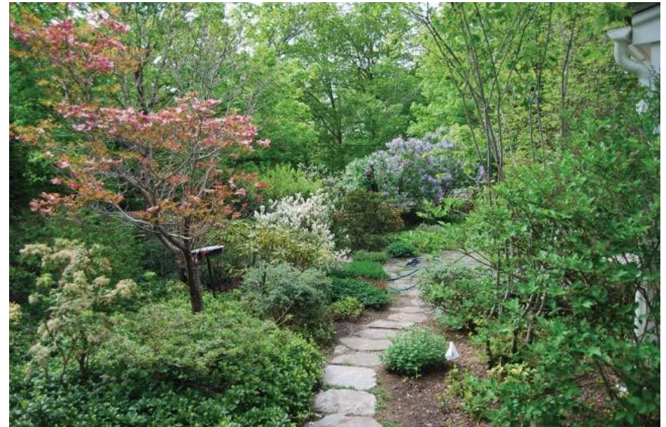
New Canaan, CT

A native plant is one that occurs naturally in a particular habitat, ecosystem or region without human introduction. It is well adapted to that region's soil, moisture and weather conditions. Native plants are crucial for native wildlife: they provide food and shelter for 10 to 15 times more species of birds, butterflies and other native wildlife than non-native plants. By planting native species that provide high quality food sources, nesting habitat and shelter through all seasons of the year, our backyards can serve as important refuges for birds and a vast array of other wildlife.